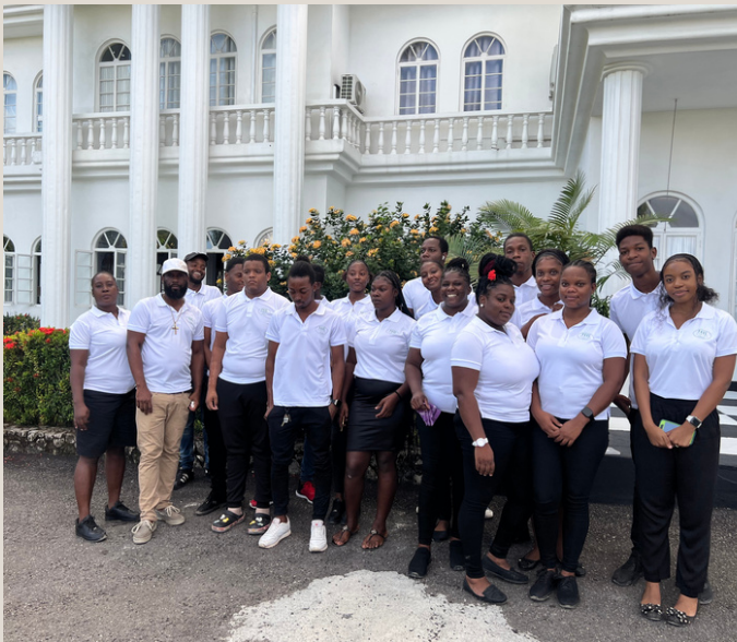
KITCHEN COOK & HOUSEKEEPING STUDENTS