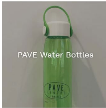
PAVE Water Bottles